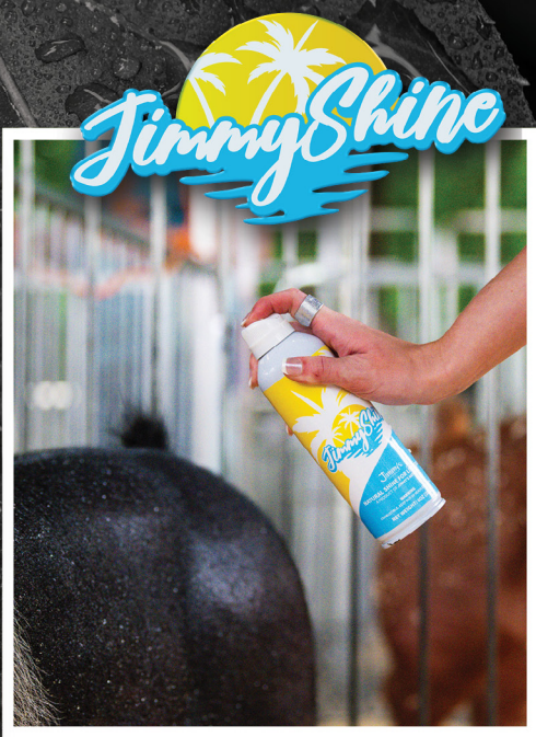
Shine THE JIMMY WAY