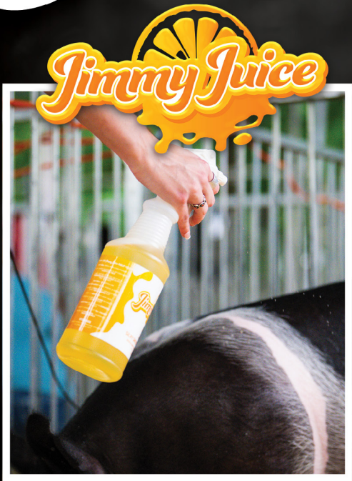
Condition THE JIMMY WAY