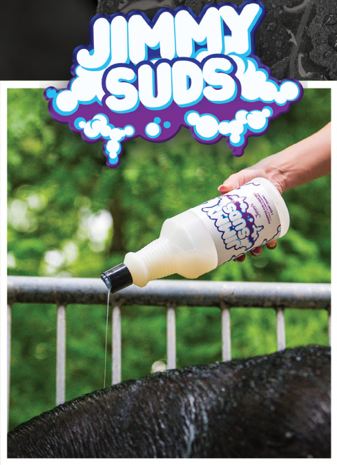
CLEAN THE JIMMY WAY